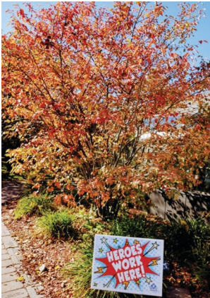
The beauty of Fall is reflected in the Serviceberry Tree at Wingspan’s Plato campus.