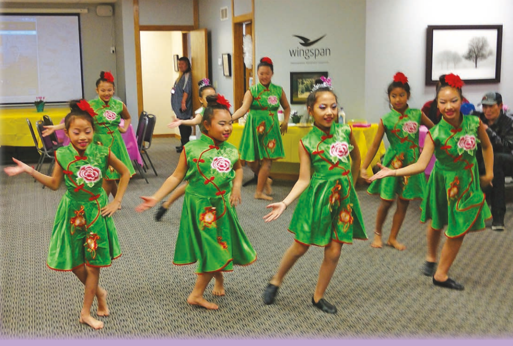
Young dancers from The Community School of Excellence K-8 Hmong language and cultural school.